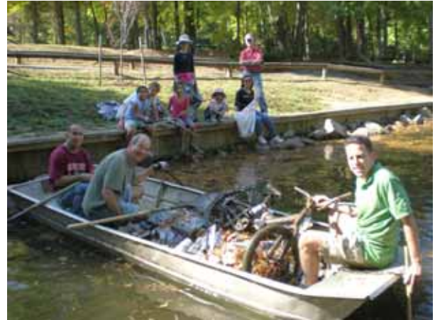
Cleaning trash from the lake and shore