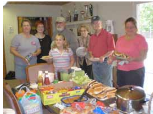
Lunch after the community clean-up