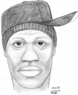
November 5 Sexual Assault Suspect