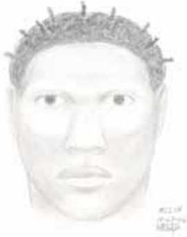
October 31 Robbery Suspect